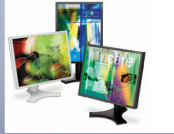
Standard, Customizable Displays