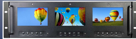
Dual & Triple Rack Mount Monitors with special functions and interfaces ; designed from scratch