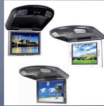
Custom models for police and public transportation vehicles