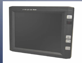
Portable/Field Monitors 5.5", 7" & 8"