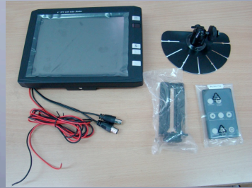
Portable test monitor with custom cables, stand and interface