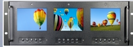
Rack Mount Monitors