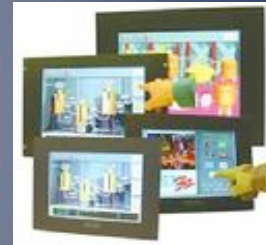
Touch Screen Monitors