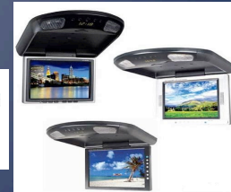
Mobile (In-Vehicle) Monitors 3.5" to 10"